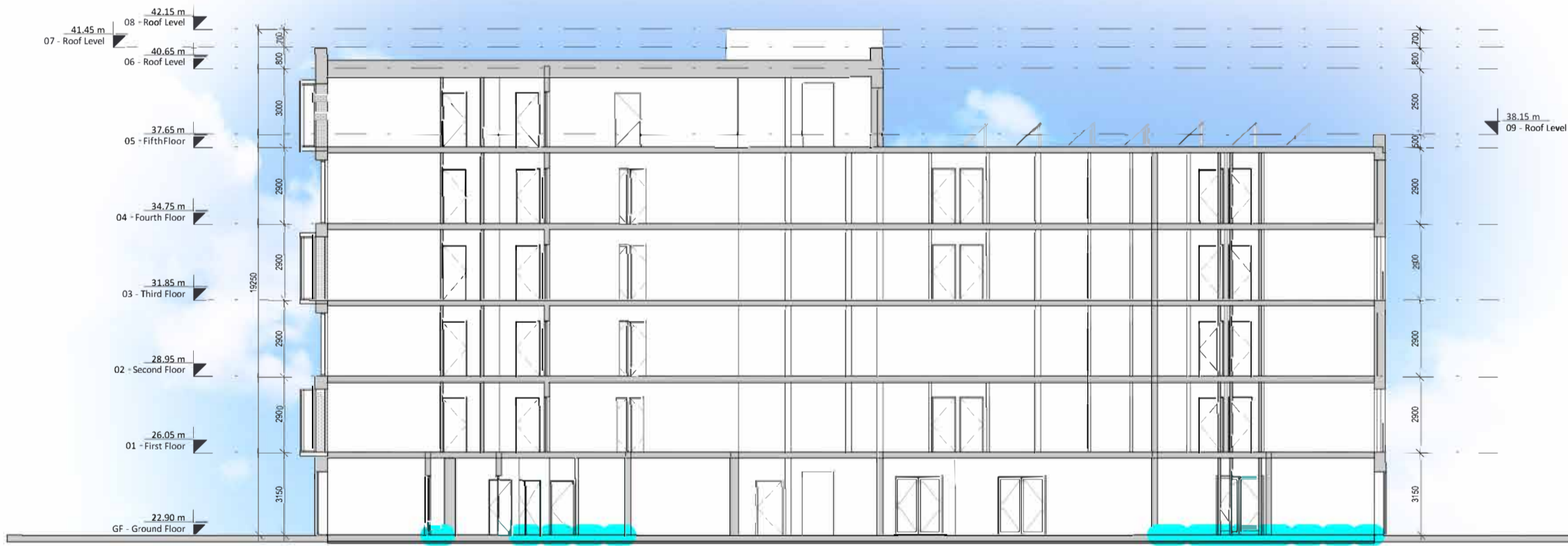
⑤ Section 1 1:200