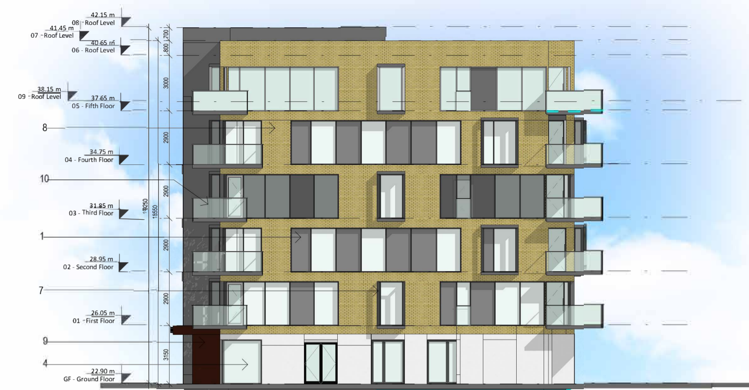
② North 1:200