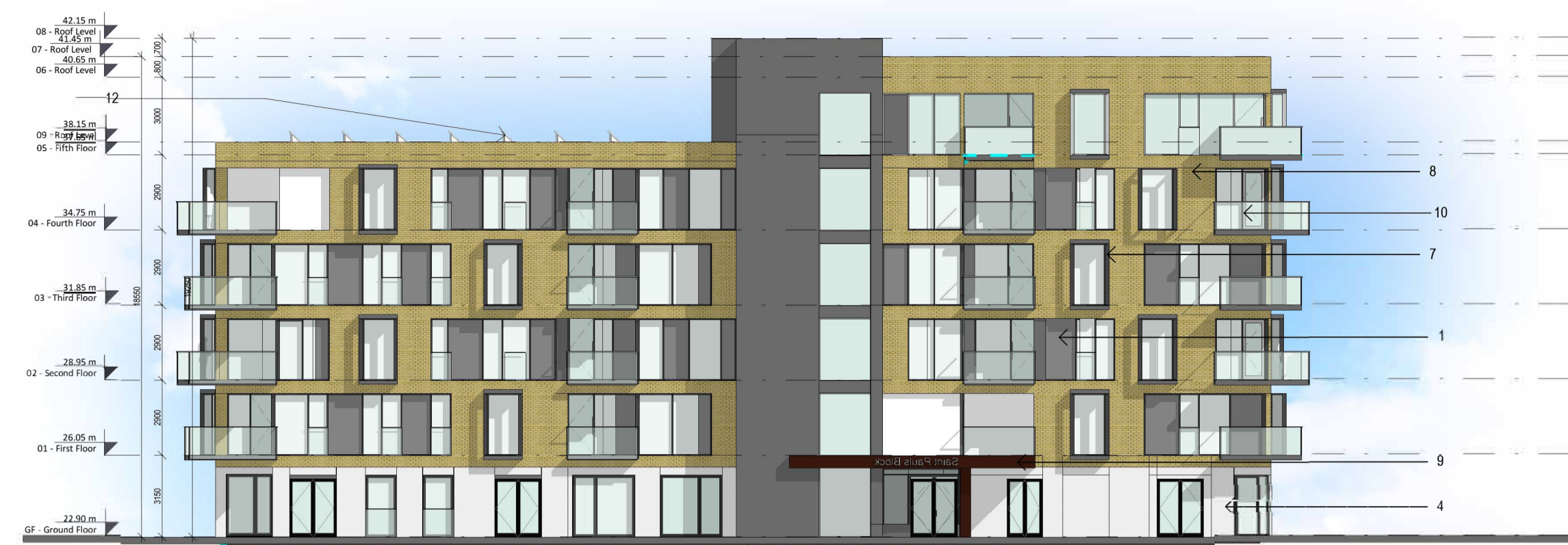
① East 1:200