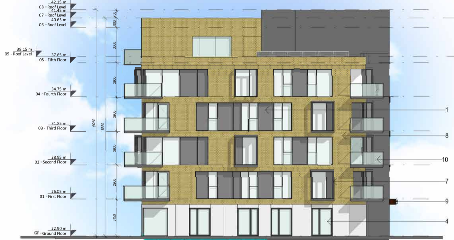
③ South 1:200