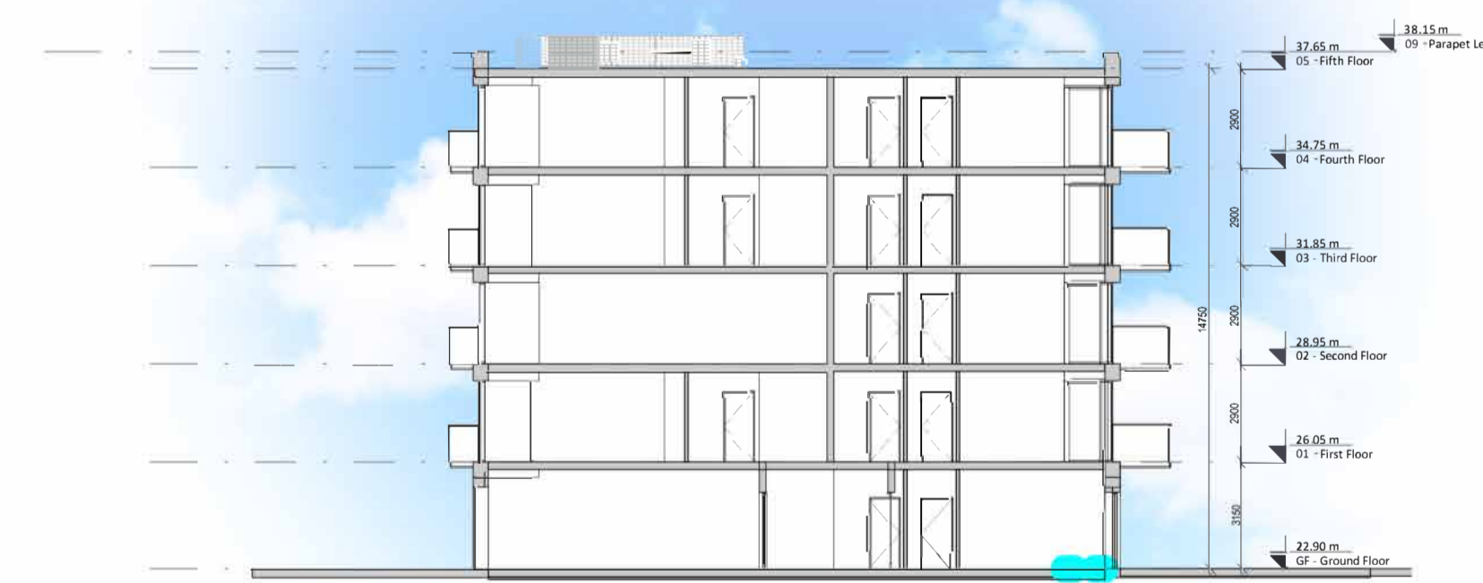
⑥ Section 2 1:200