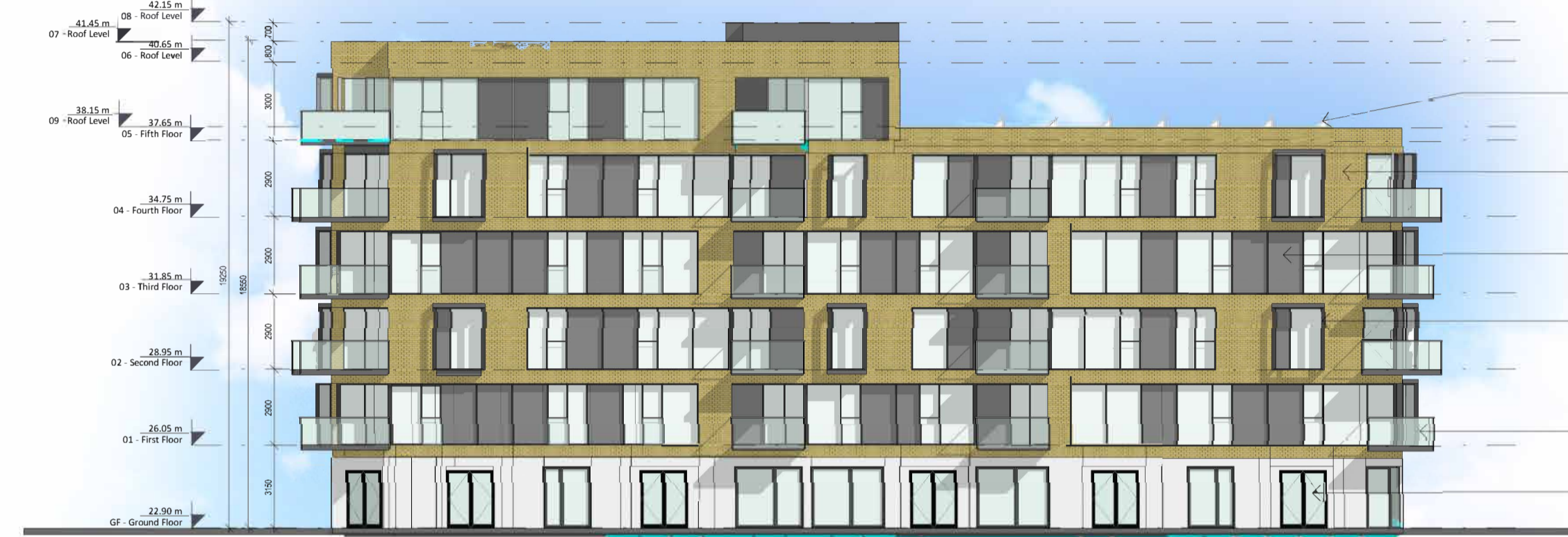
④ West 1:200